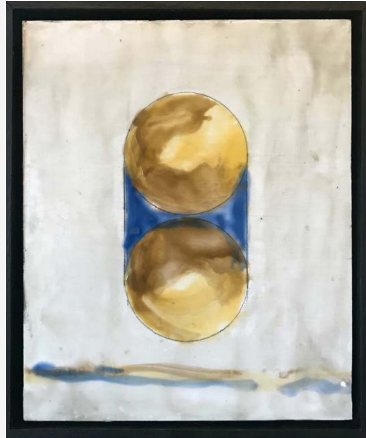
Vogelsang Binary 3 Wax on wood 30x25cm