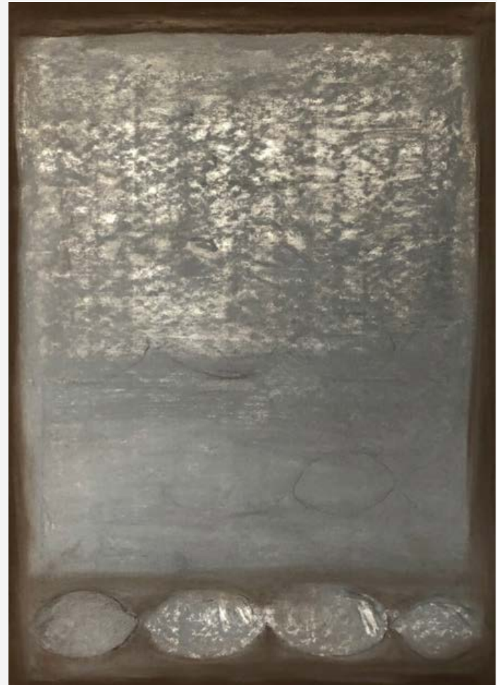
Reduction Series 1 Charcoal, graphite on paper 70x50cm