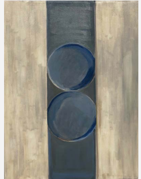
Dream of Reason I Oil on canvas 66x51cm