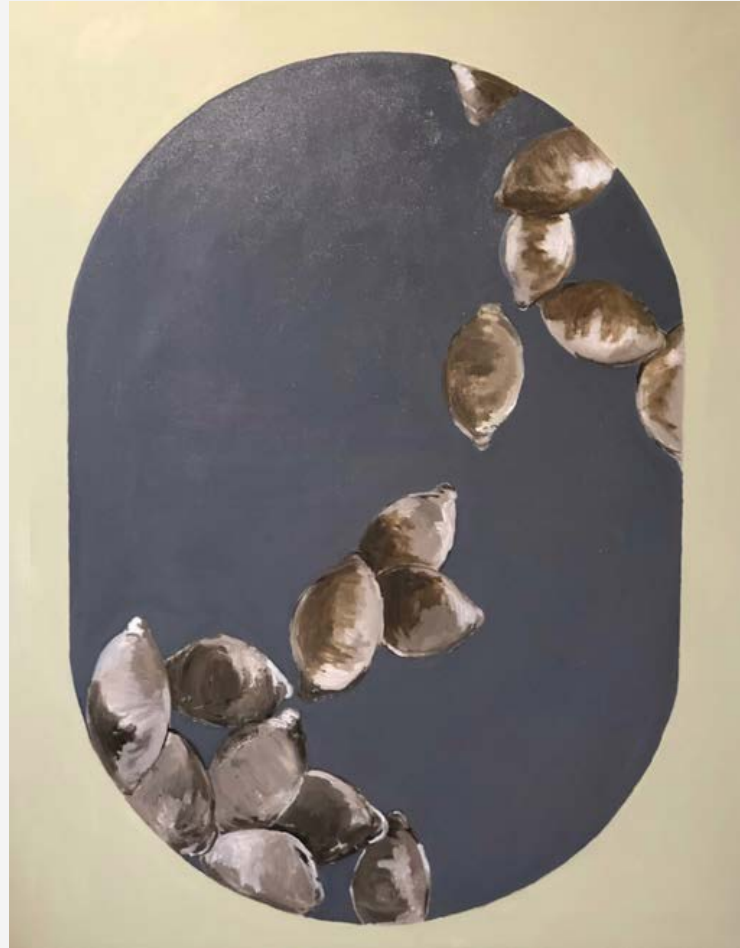
Ovoid Lemon 17 Oil on canvas 100x80cm