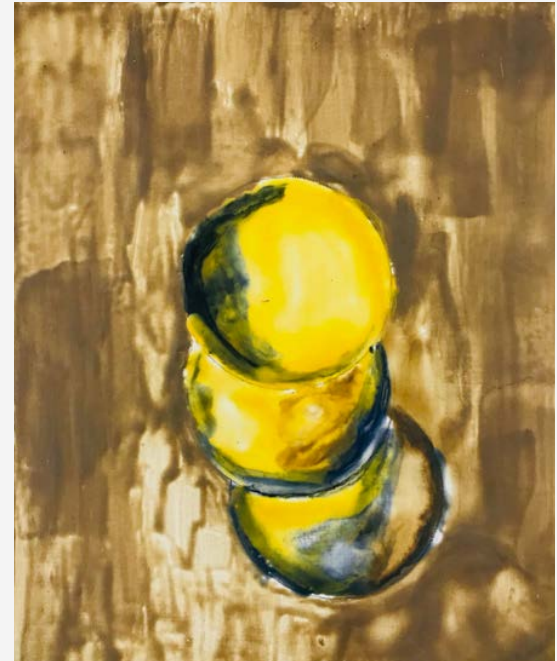
Vogelsang Ultramarine Wax on wood 30x25cm