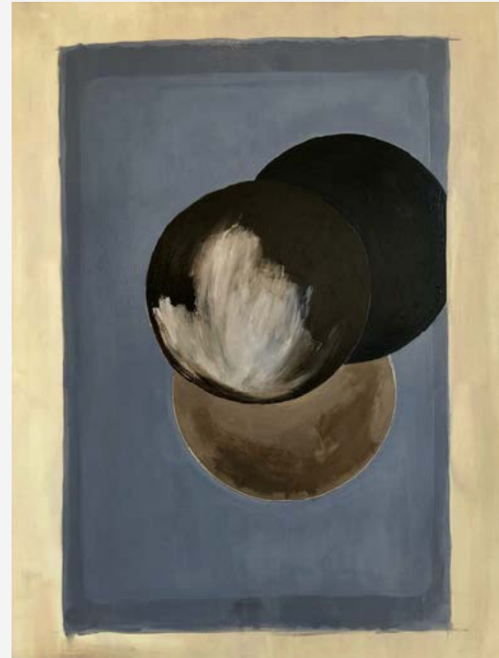
Terra D'ombra Binary Oil on canvas 80x60cm