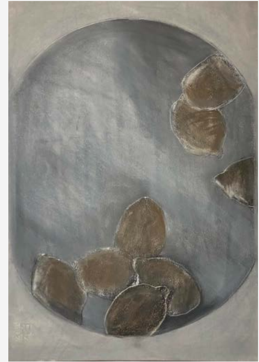
Ovoid Series (6 lemons) Charcoal, graphite on paper 48x33cm