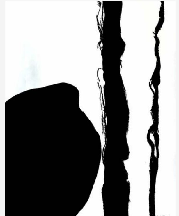
Untitled (Also Sprach Zarathustra 4) Charcoal on paper 70x50cm