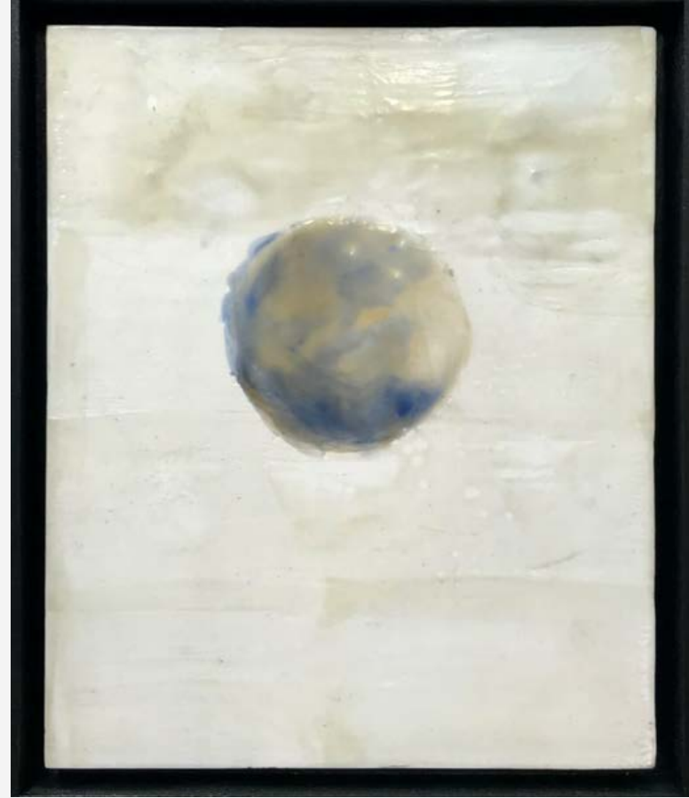
Vogelsang Binary Wax on wood 30x25cm