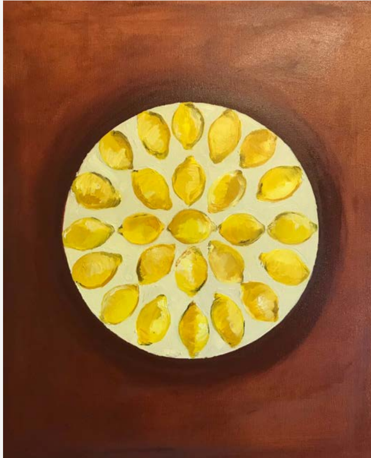
Arrival of Complexity V Oil on canvas 82x66cm