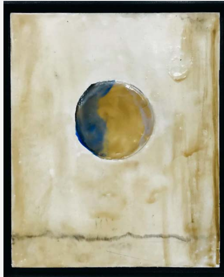
Vogelsang Corona Wax on wood 28x23cm