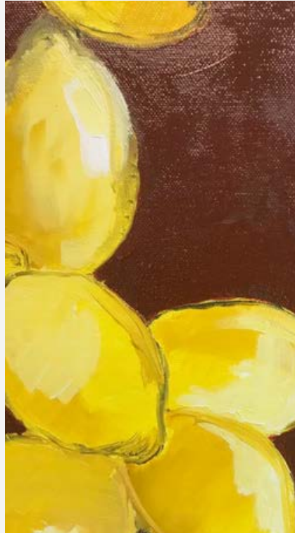
— Arrival of Complexity II Oil on canvas 102x82cm